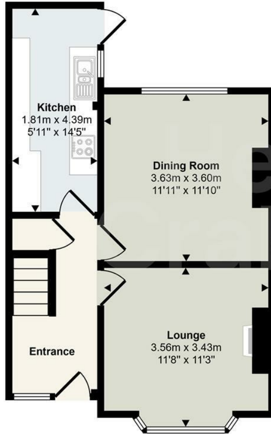
Ground Floor Approx 41 sq m / 445 sq ft